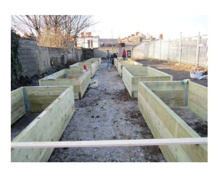
Community Garden as of March 2011